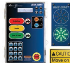
Blue Genius™ Control Panel and traffic lights package come standard with Blue Giant hydraulic vehicle restraints

Blue Giant hydraulic vehicle restraints hold trucks securely at the loading dock, improving safety levels during cargo handling operations. Our models are low-profile, have a wide restraining range, and can engage a wide variety of ICC bars, including those that are bent or damaged. Comes with the Blue Genius™ Gold Series II Vehicle Restraint Control Panel and traffic lights package.